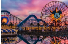
Disneyland: California Adventure

There are hundreds of exclusive Southern California attractions to choose from, and our experienced concierges will help you decide where best to spend your time. Some examples are: Disneyland/California Adventure, LEGOLAND®, Hollywood, Universal Studios, Rodeo Drive, San Diego Zoo, Santa Monica Pier, LA Live in Los Angeles, and the Montage Resort at Laguna Beach.