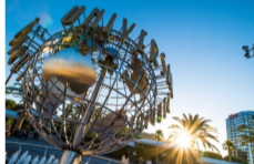
Los Angeles & Universal Studios Hollywood

After deciding on where you'd like to go and what you'd like to do, you will make a deposit to start scheduling your complete vacation and cosmetic surgery package with your Cosmetic California agent.